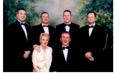
The IATP Team at the 2013 Annual Dinner

I am so proud to represent IATP as the Non Voting Chair Person, we have moved mountains since April 2009 when we launched with just 4 Members, and we now represent nearly 100 individual asbestos training companies in the UK, NI & Guernsey. Many of our Members offer other asbestos related services so we do truly represent a well rounded reflection of the UK asbestos industry sectors.